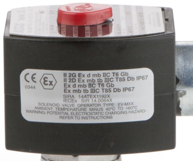
Figure 1: labels may have multiple T-codes to cover every real-world contingency.

If conditions at the facility where the valve will be used might qualify as this kind of special circumstance, consult the valve manufacturer before specifying a final purchase.